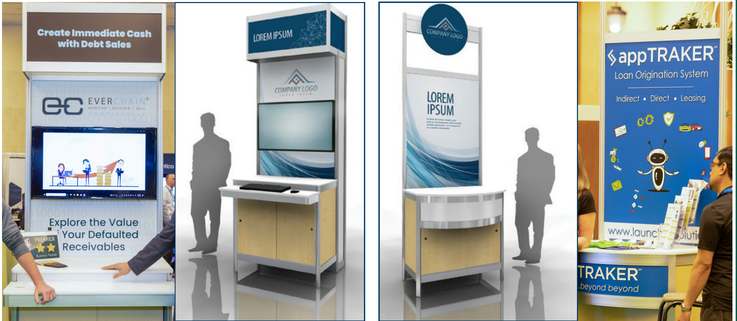
Images only used for similar kiosk reference - will not be exact.